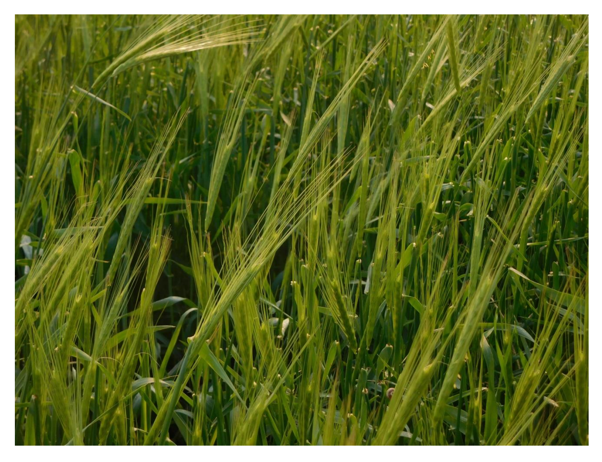
Goat grass barley location in Jordan Valley