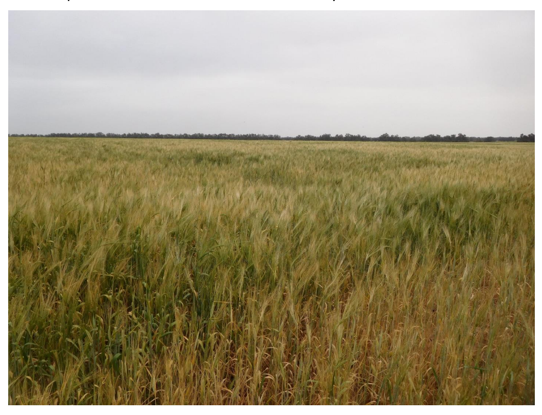
The second is wild barley

The first picture is of 2 and 6 row domestic barley